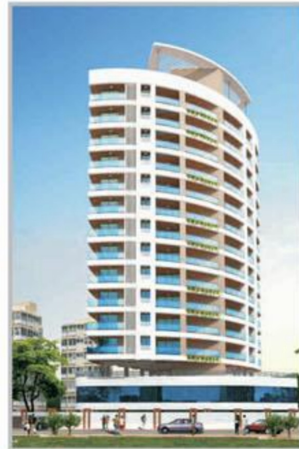
Aditya C.H.S., Andheri (E)