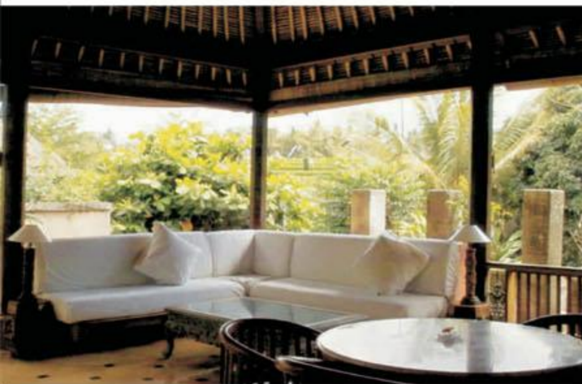
Gazebo Peaceful & Secluded lounge area