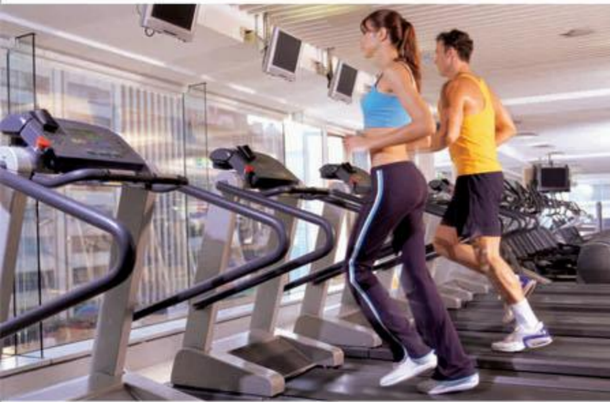
Gymnasium: Ultra modern well equipped gym