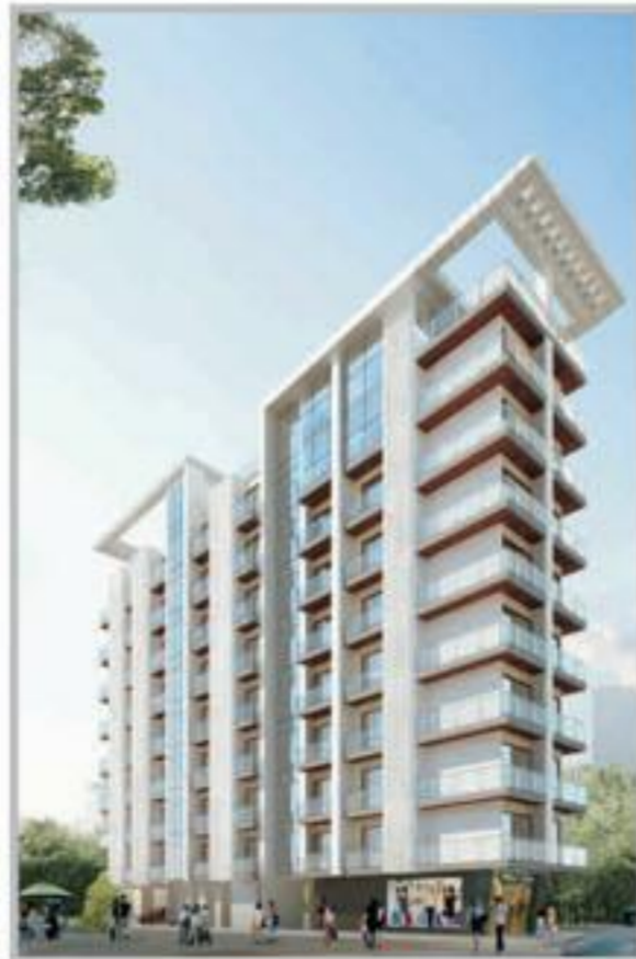
Gurukul C.H.S. Ltd., Borivali (W)