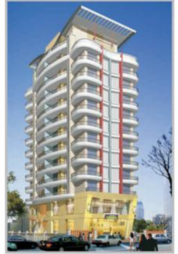
Bhagyayog Apartment, Borivali (W).