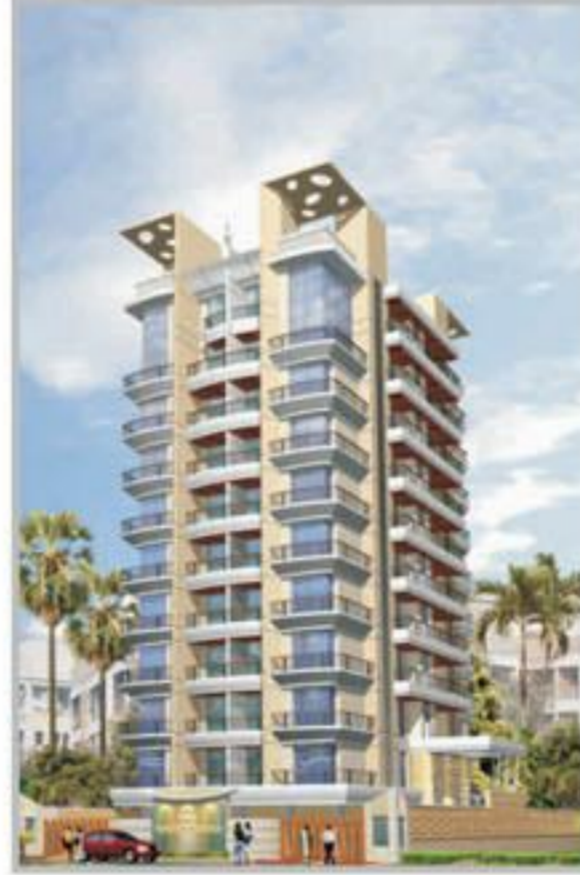
Kastur Park Brij C.H.S., Borivali (W).