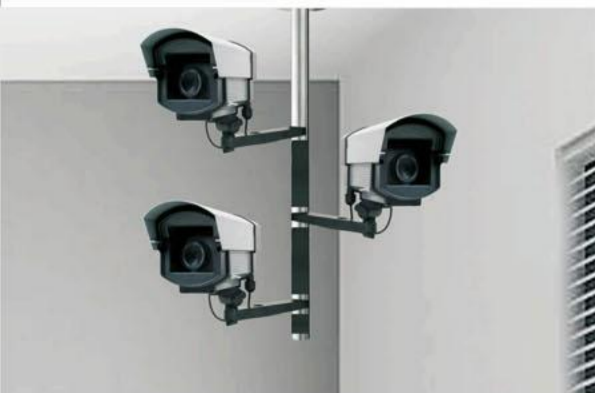
CCTV monitoring system: 24 x 7 high tech Multilevel Security System