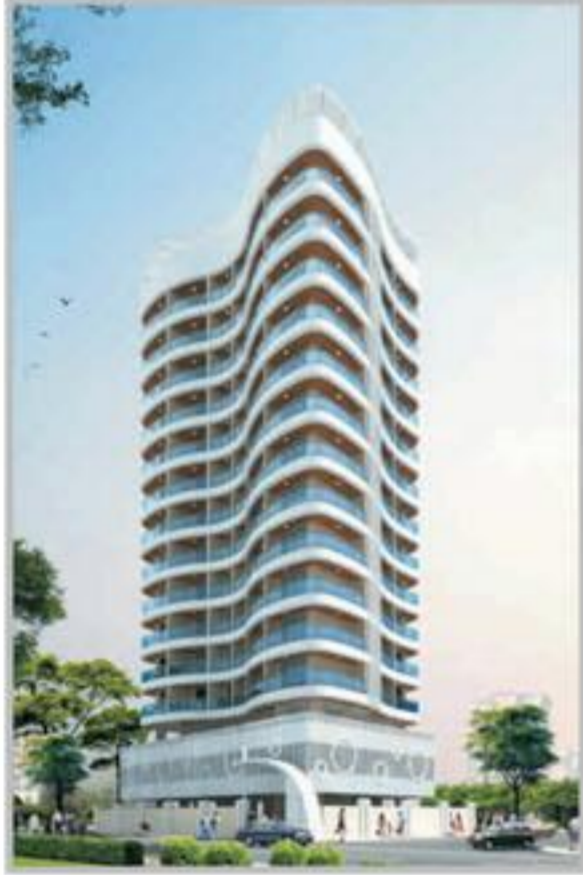
Shanti Vijay Apartment, Vile Parle.