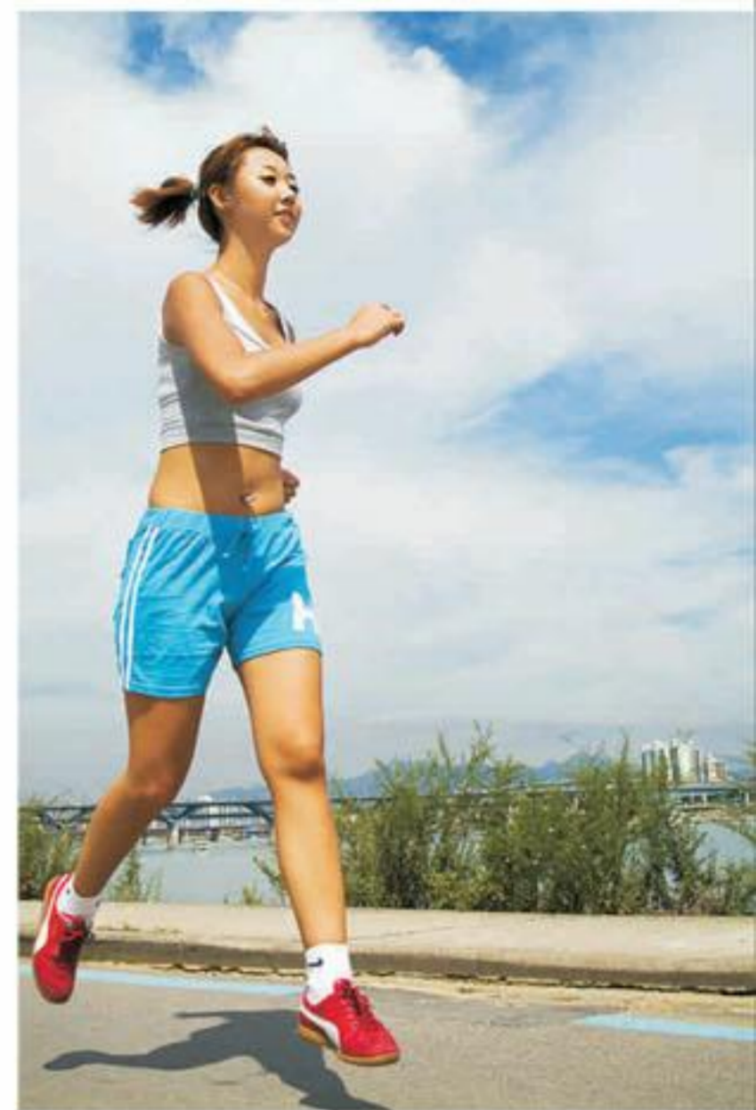
Temple: Calm & Serene Meditation area